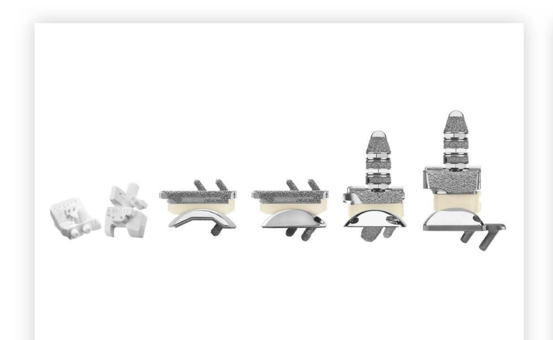
Total Ankle Replacement