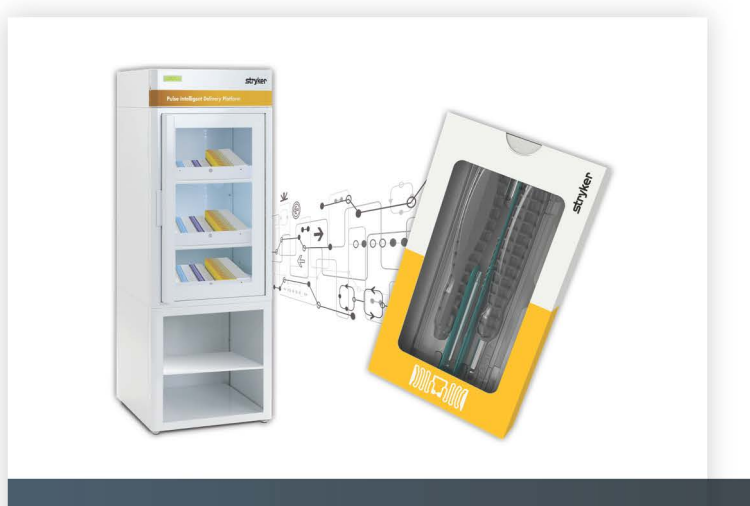
Pulse Intelligent Delivery Platform