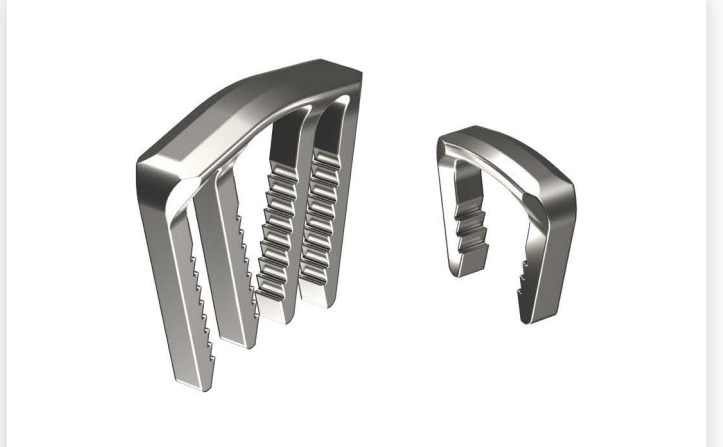
EasyFuse ™ Dynamic Compression System